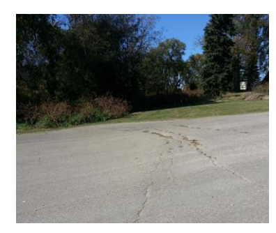
Sloughing at Lincoln Drive Park boat ramp

Fluctuating river levels are a challenge in maintaining the paved boat ramps. River silt remains on the ramps after the water recedes but it can take several days before the silt can be removed. The river fluctuations can also cause the need to remove the floating docks. Low water also affects use of