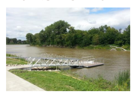
Floating dock in downtown Grand Forks

Both cities maintain several developed river access facilities. In addition, at least six primitive sites have been created by anglers. The primitive sites are not maintained by either City at this time. The developed sites include: