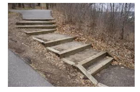
Example of box steps