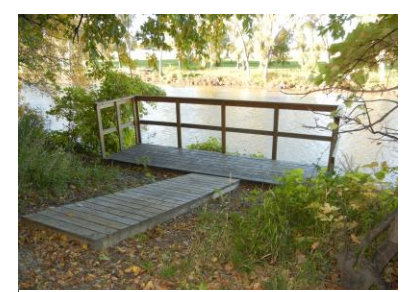
Wood platform at Red River State Recreation Area