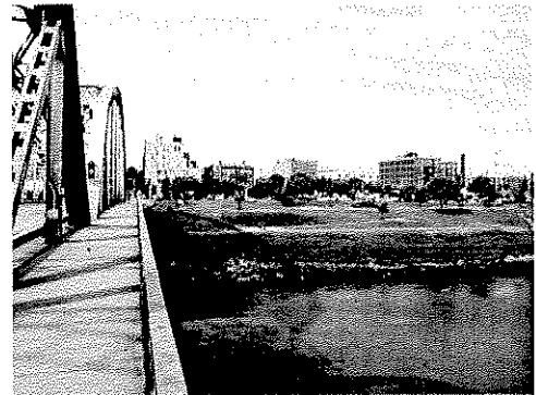
Figure 21: Protecting the natural greenspace of the communities will be as important as restoring the cultural heritage.